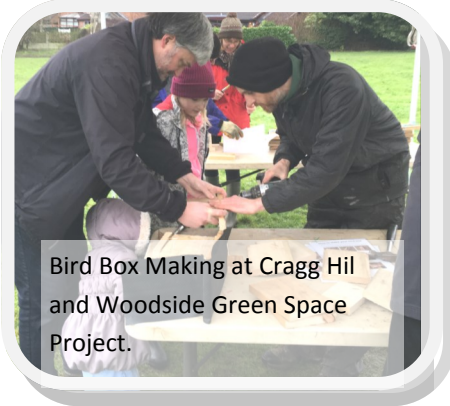
Bird Box Making at Cragg Hill and Woodside Green Space Project.

Funding will go to Care & Repair to support vulnerable residents to access equipment which will help their property to be safer.